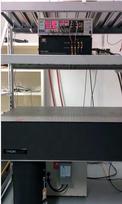
Compressor unit fits under optical table.