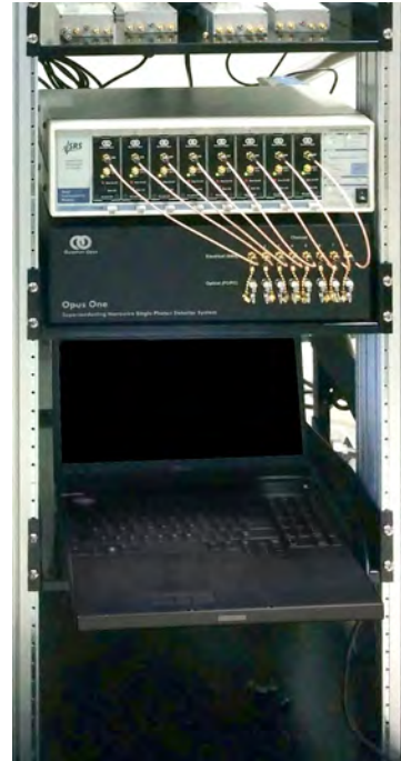
Cryostat and electronics easily rack mountable.